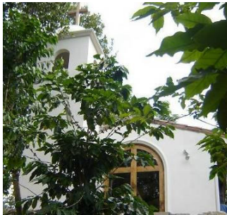
The chapel at La Finca

When you reap your harvest in your field and have forgotten a sheaf in the field, you shall not go back and get it; it shall be for the alien, for the orphan, and for the widow, in order that to Lord your God may bless you in all the work of your hands.