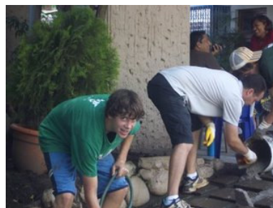
Fourth Presbyterian guys working at La Casa de mi Padre

If you'd like to learn about how you can join a team or plan a trip, contact us at info@mfhinternational.org .