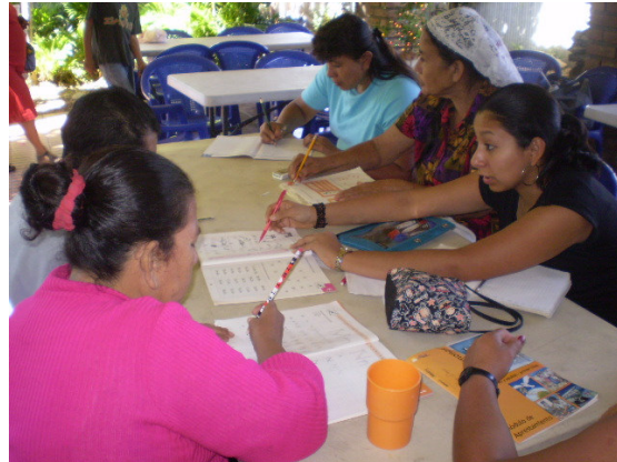
Literacy classes for families